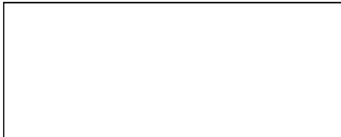
Signature of Parent/Guarantor